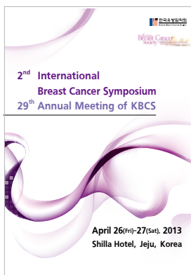
2nd IBCS, 2013