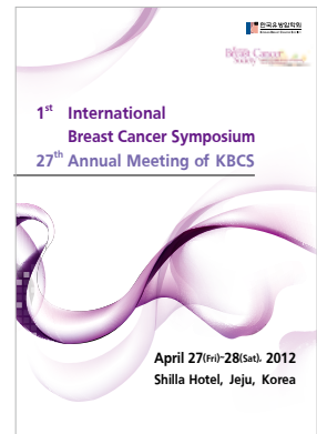
1st IBCS, 2012