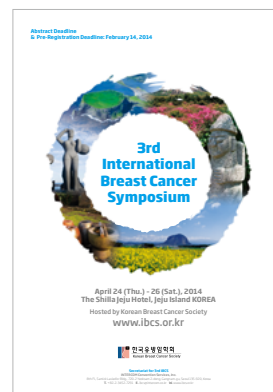
3rd IBCS, 2014